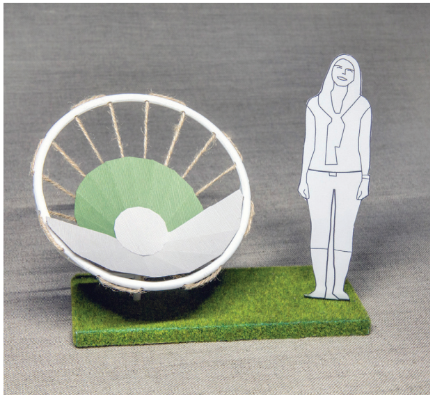
Mockup of Flower Chair

"The process of designing it at Street Furniture has been