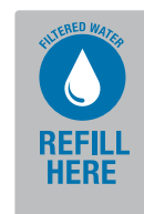
UV Vinyl 'Filtered'