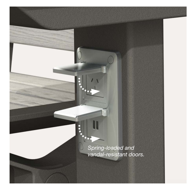
Strong, tried-and-tested power outlets are housed in a tough RHS frame. (IP rating 55)

Table tops are offered in both bright and neutral colours to suit your space. See colour options at <a href="mailto:streetfurniture.com/colour-chart">streetfurniture.com/colour-chart</a>