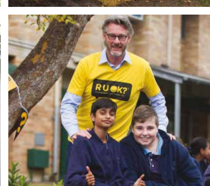
RU OK benches create 'conversation corners' to help students spark conversations that may help combat depression. Flat-pack kits are offered to schools nationally.