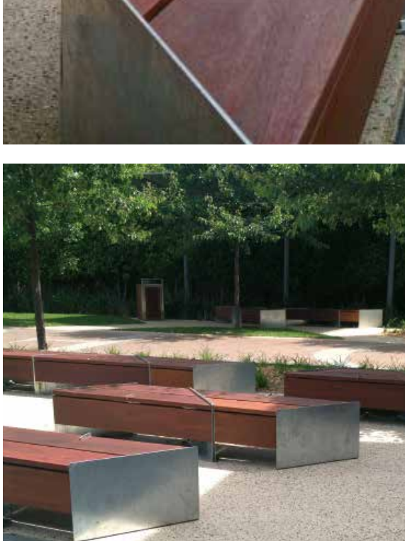
Custom benches were a feature on the Coleman Walk, designed by ACLA. Trapezium modular components, reinvent the parklands, from the master plan to the finest constructed from oversize hardwood battens and stainless panels, cleverly align to form shapes.

OFFICES IN SYDNEY, MELBOURNE, BRISBANE, ADELAIDE AND PERTH