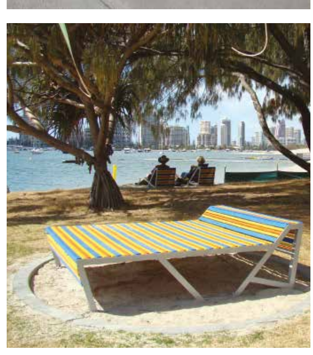
Bright recycled plastic furniture complement the active green waterfront. AECOM was commissioned to furniture details.